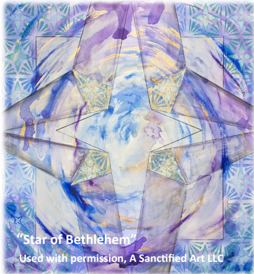
"Star of Bethlehem"

Used with permission, A Sanctified Art LLC